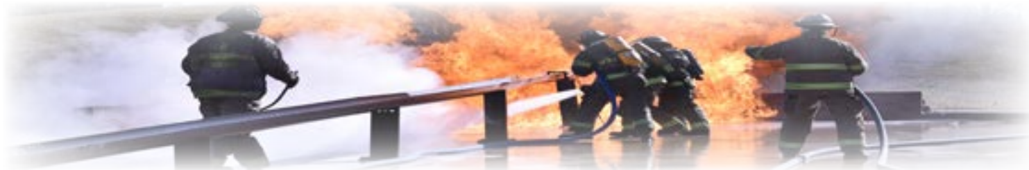
2018 PARTICIPATION REPORT BY ORGANIZATION (Cont.)