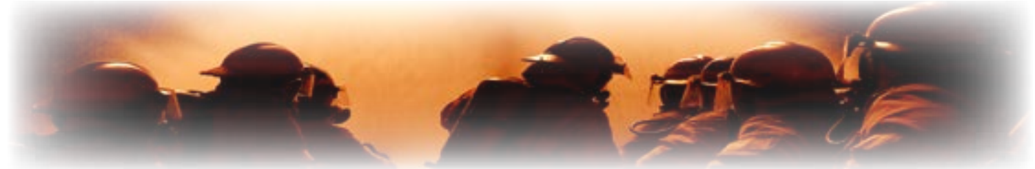
2018 PARTICIPATION REPORT BY ORGANIZATION (Cont.)